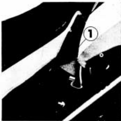
① Seat latch

The oil filler cap contains a dipstick ② for measuring oil level. Oil level should be checked with the ATC 90 resting on level ground and the oil filler cap touching the filler orifice but not screwed in. Oil level should be maintained between the upper ③ and lower ④ oil level marks on the dipstick.