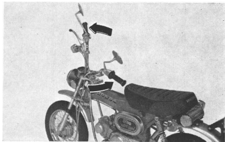
② Clamp lever