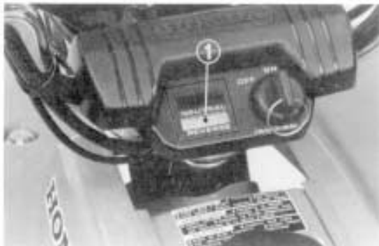
(1) Reverse indicator lamp

The TRX125 is equipped with a reverse indicator lamp (1) to show when the transmission is in reverse. The reverse indicator lamp is on the handlebar upper holder. The lamp lights with the ignition switch ON when the transmission is in reverse.