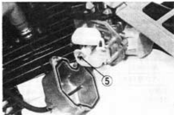
(5) Main jet