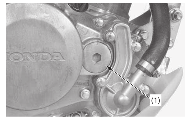
(1) crankshaft hole cap