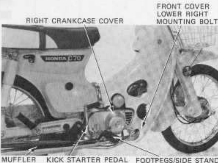
RIGHT CRANKCASE COVER

Remove the front cover lower right mounting bolt. Remove the kick starter pedal and muffler. Support the motorcycle with a suitable stand and remove the footpegs/side stand assembly. Remove the right crankcase cover.