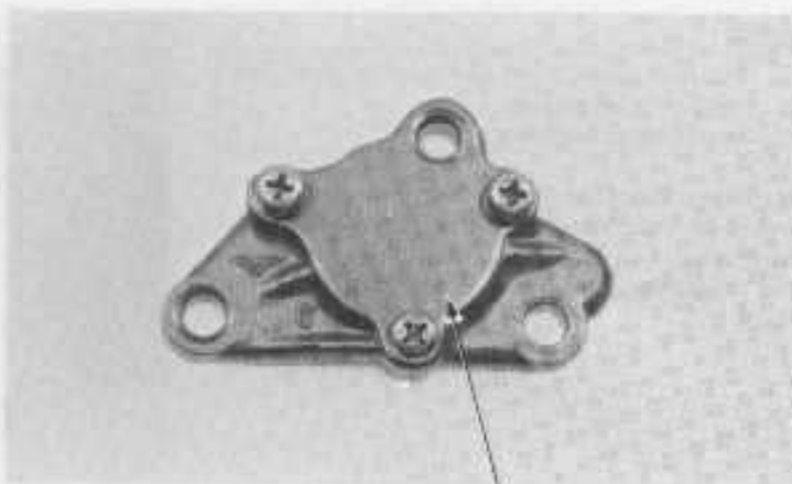
PUMP BODY COVER