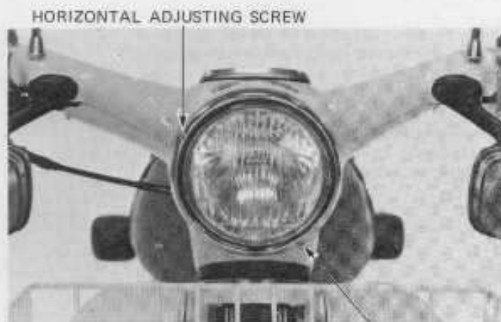
VERTICAL ADJUSTING SCREW

An improperly adjusted headlight may blind oncoming drivers, or it may fail to light the road for a safe distance.