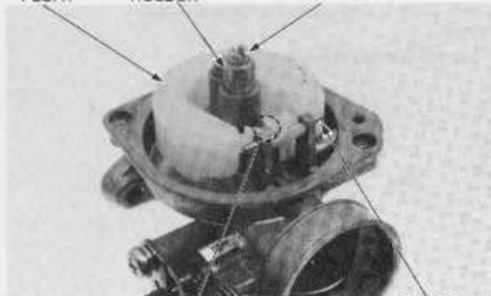
FLOAT VALVE FLOAT PIN