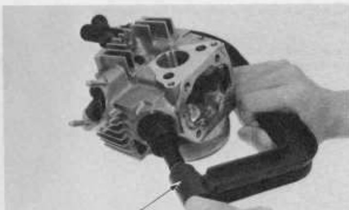
VALVE SPRING COMPRESSOR

To prevent tension loss, do not compress the valve spring more than necessary to install the valve cotters.