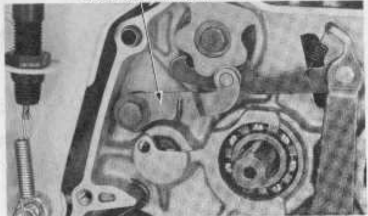
DRUM STOPPER ARM