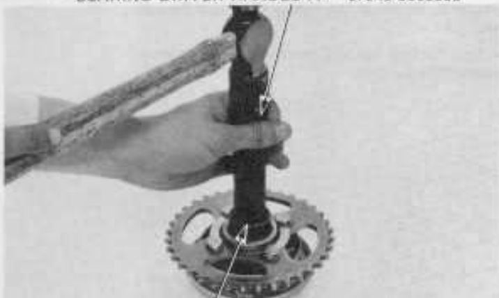
BEARING DRIVER OUTER, 37 x 40 mm