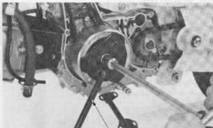
FLYWHEEL HOLDER 07922-1790000 U.S.A. ONLY - USE COMMERCIALY AVAILABLE BAND STRAP WRENCH