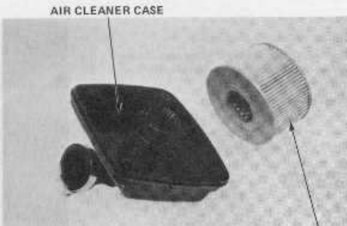
AIR CLEANER CASE