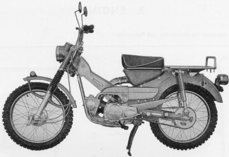
Posi-torque (F. No. 00001A and subsequent)