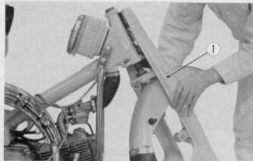
Fig. 4.36 Removing front fork ① Front fork

Next, by removing the front arm pivot bolt and 8×42 hex bolt, the front cushion and the front