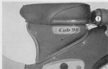
Fig. 4.39 A Fuel tank (CT 90) ① Fuel tank