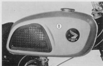
Fig. 4.39 B Fuel tank (CL 90) ① Fuel tank