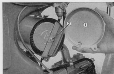
Fig. 4.67 Removing air cleaner mounting bolts (S 90) ① Air cleaner case cover ② Air cleaner mounting bolt