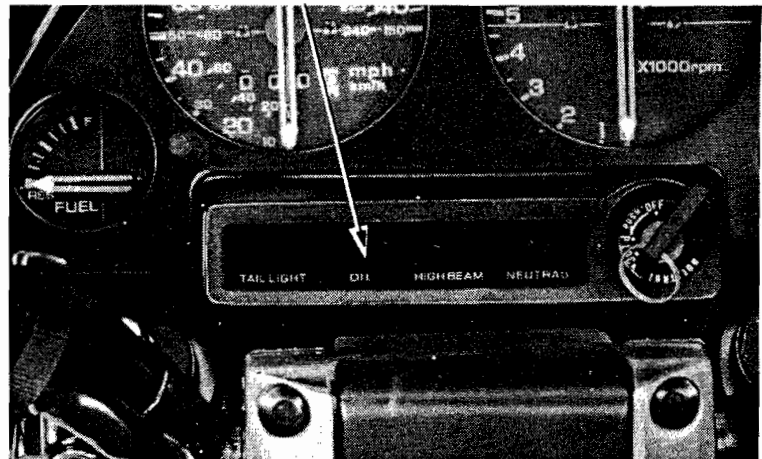
OIL PRESSURE WARNING LIGHT

If the oil pressure and warning systems are normal pressure switch with a new one.