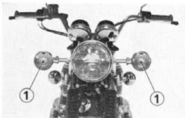
Fig. K5-8 ① Front turn signal light

The front and rear turn signal lights were changed to new, larger types. See Figs. K5-8 and K5-9.