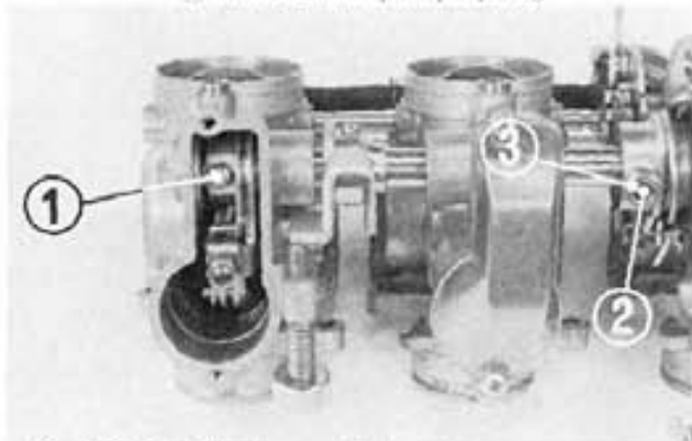
Fig. K7-6 ① Link arm fixing screw ② Set screw ③ Lock nut