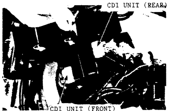
CDI UNIT (FRONT)

If any further abnormalities then replace the CDI unit