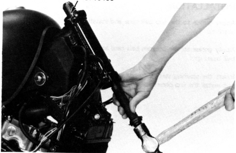
BEARING RACE REMOVER/ INSTALLER 07946-3710400

Remove the sliding guide from the bearing race remover.