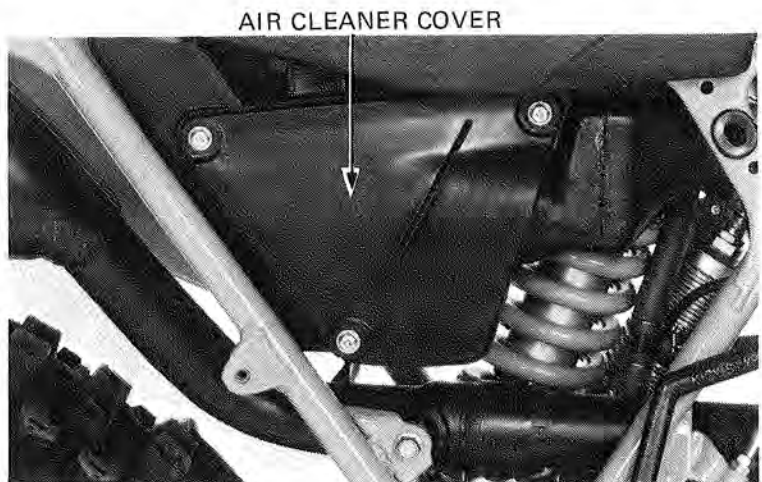
AIR CLEANER COVER

Remove the right side cover. Remove the air cleaner cover.