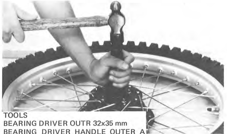
TOOLS BEARING DRIVER OTR 32x35 mm BEARING DRIVER HANDLE OUTER A DRIVER PIVOT 15 mm

Grease on the brake linings reduces stopping power. Keep grease off the brake linings. Wipe excess grease off the cam.