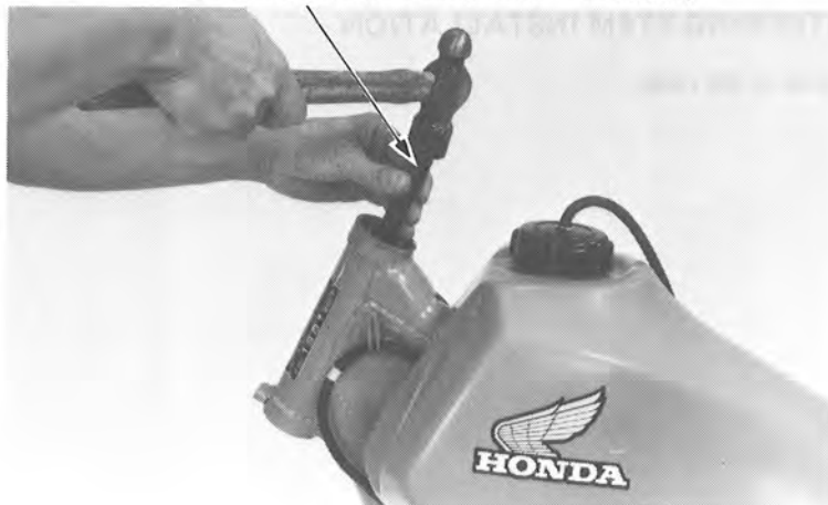
BALL RACE REMOVER (07953-MA00000)

Remove the ball race with the Ball Race Remover.