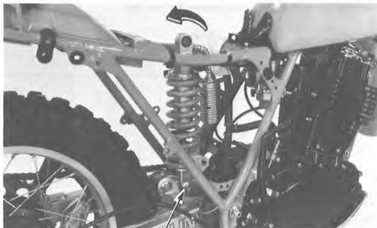
LOWER MOUNT BOLT

Do not let the shock absorber touch the frame brackets when lifting up the rear wheel. This may cause damage to the shock absorber thread.