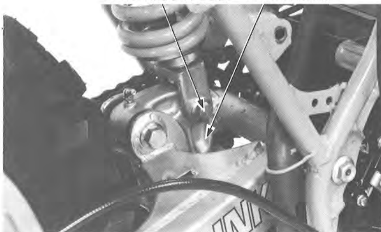
LOWER MOUNT BOLT TENSION ARM