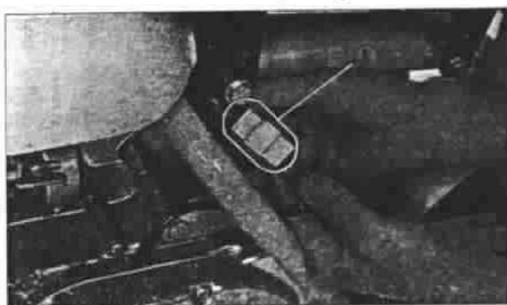
① Electric leads coupler Fig. 2