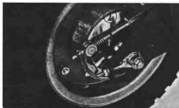
① Brake rod adjusting nut ② Brake rod B Fig. 55