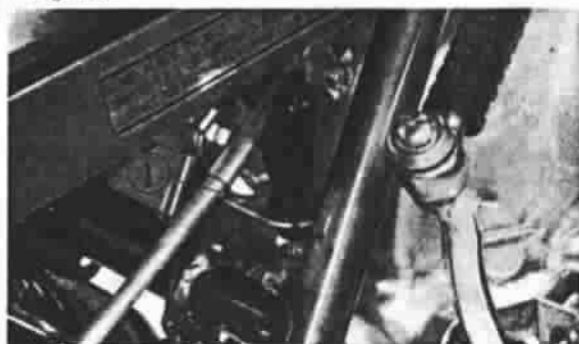
Fig. 60 ① Adjuster nut