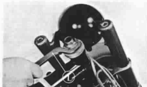
① Fork top thread Fig. 42

The spring pin must be flush with the end faces of the piston.